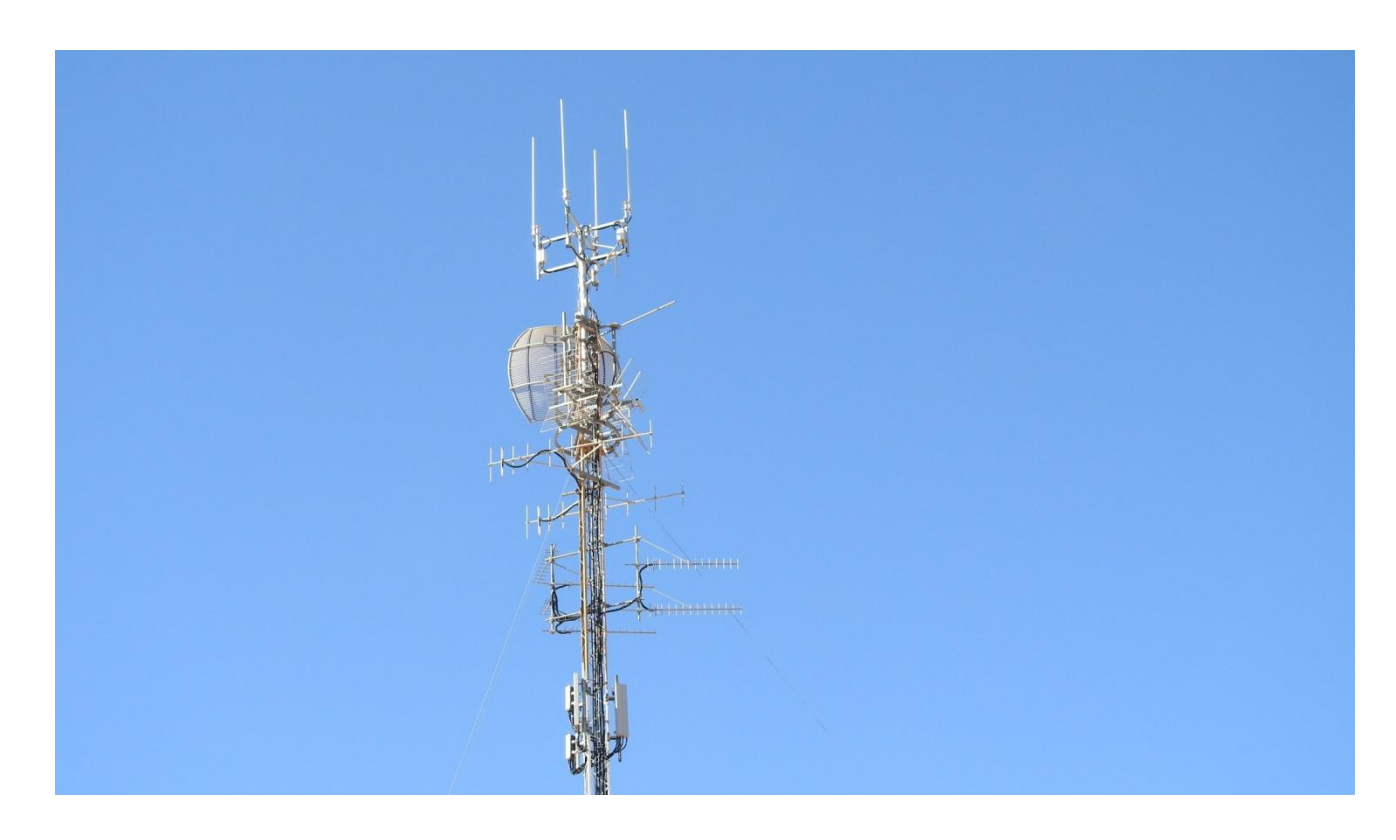
The Telstra Communications tower at Birdsville