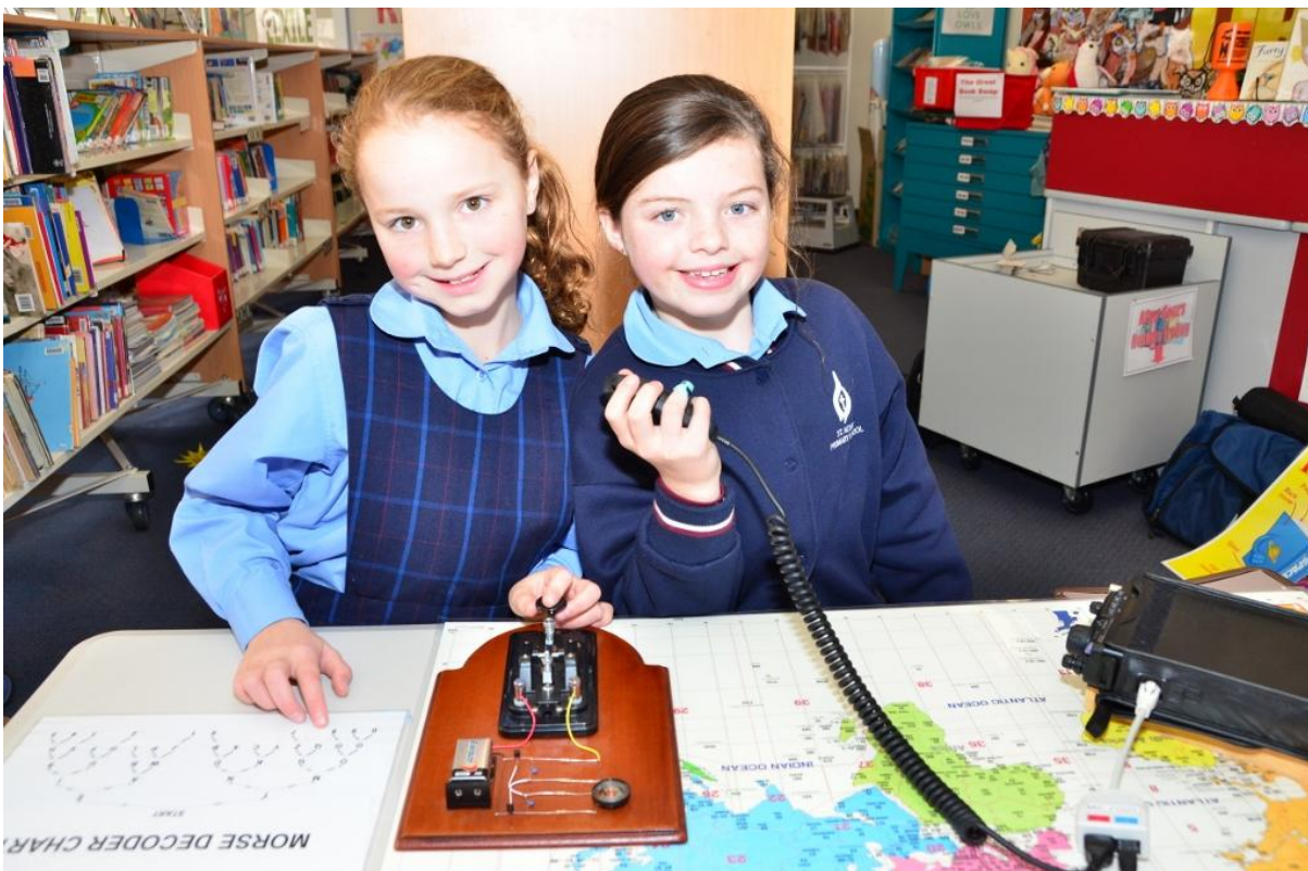
“We love Radio Club”

Their presentation covered the setup and operation of a club and it presented actual feedback from principals, teachers, parents and students highlighting the educational and inspirational virtues of this fun activity for girls and boys alike.