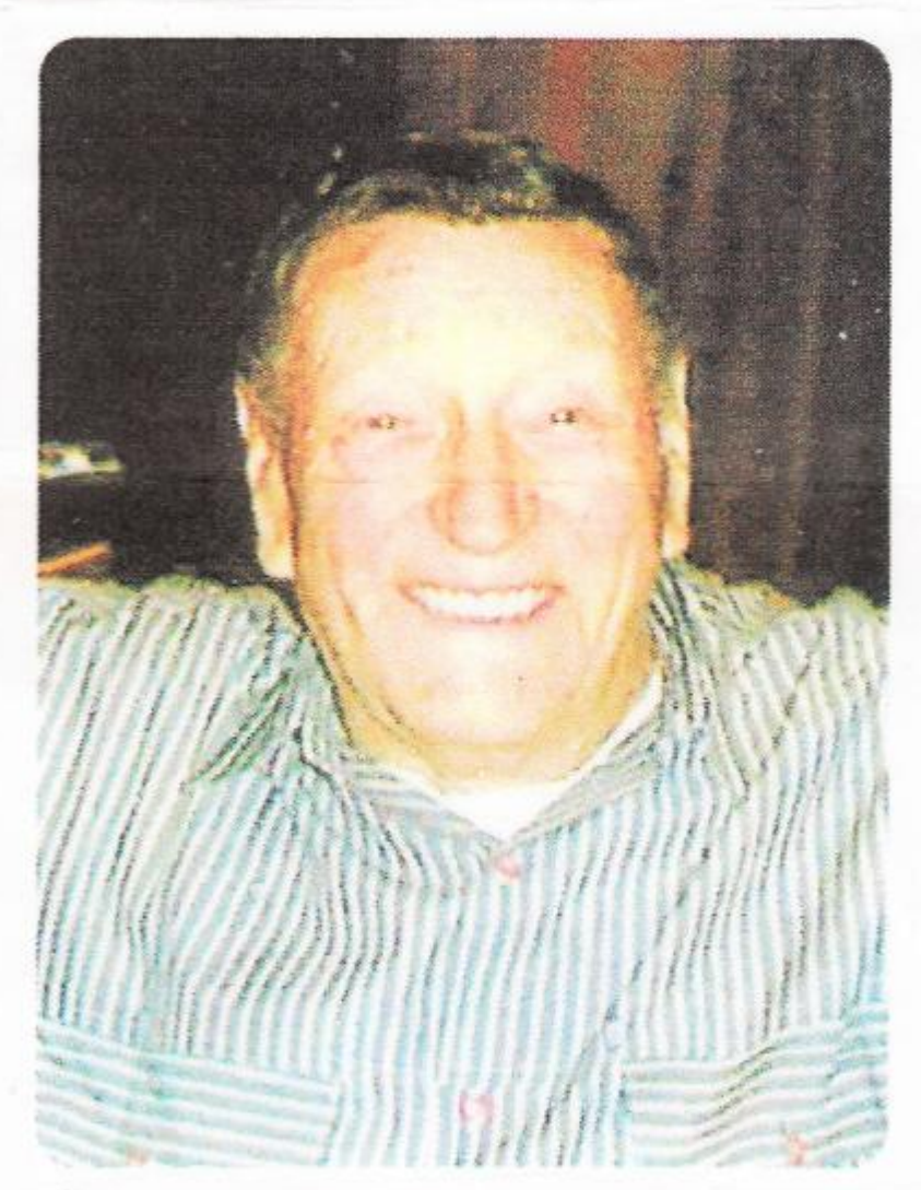
VK3-DWG (SILENT KEY) Prayer to an Unknown Soldier.