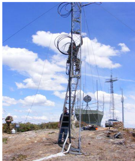
Top two photos are Bill Crocker working on the frame, bottom photos the boys are relaxing after removal of the big 2m antenna, and Ian VK3CHV climbing the tower.