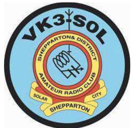
REPEATERS VK3RGV 2m & VK3RGV 70cm CLUB CALL SIGN VK3SOL