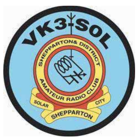
REPEATERS VK3RGV 2m & VK3RGV 70cm CLUB CALL SIGN VK3SOL