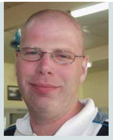
Hello to everyone,

Well it's been a pretty rough start to February, I'm sure I speak on behalf of all of us when I say our thoughts and hearts are with all the Bushfire victims across the state of Victoria.