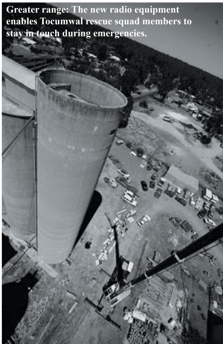
Greater range: The new radio equipment enables Tocumwal rescue squad members to stay in touch during emergencies.

Tocumwal Volunteer Rescue Association's communications have received a boost recently.