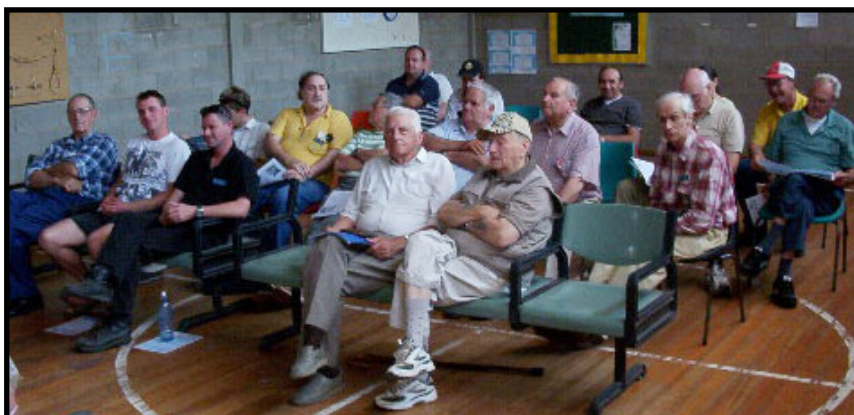
Above: Members at the annual meeting held at the Clubrooms on Saturday 7th September.