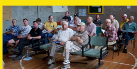
Members at the AGM