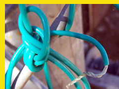
Tips for Antenna projects

HTTP://WWW.AUSTRALIANWEATHERNEWS.COM/FORECAST_FORECASTS_LONGRANGE.HTM