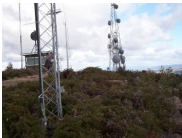
Mount Wombat summit